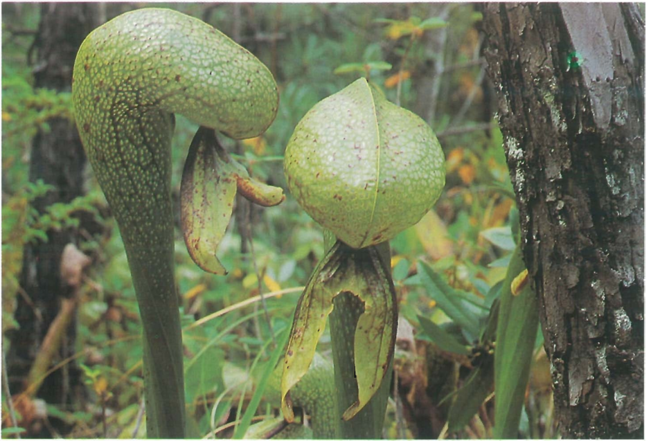
Figure 2: Darlingtonia : red-edge fang variant.