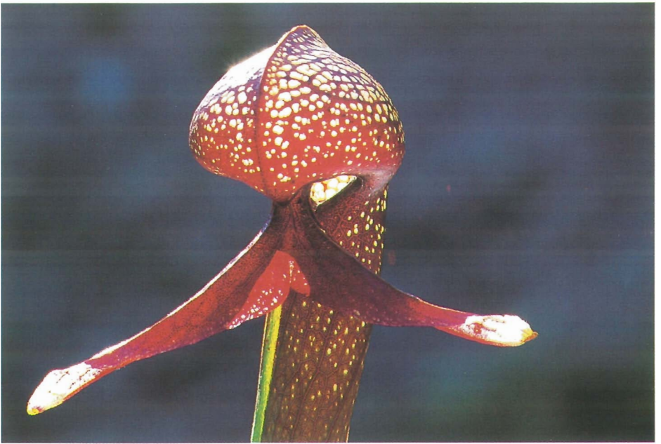
Figure 4: Darlingtonia : crimson pitcher variant.