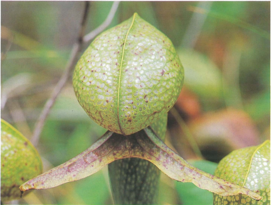
Figure 3: Darlingtonia : blush fang variant.