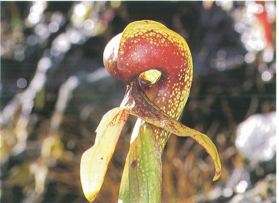
Figure 5: Darlingtonia : red keel variant.