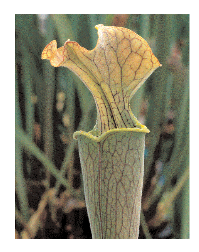
RED VEINS Sarracenia rubra subsp. wherryi (above).

Sarracenia rubra subsp. gulfensis: Similar to subspecies wherryi , but much taller.