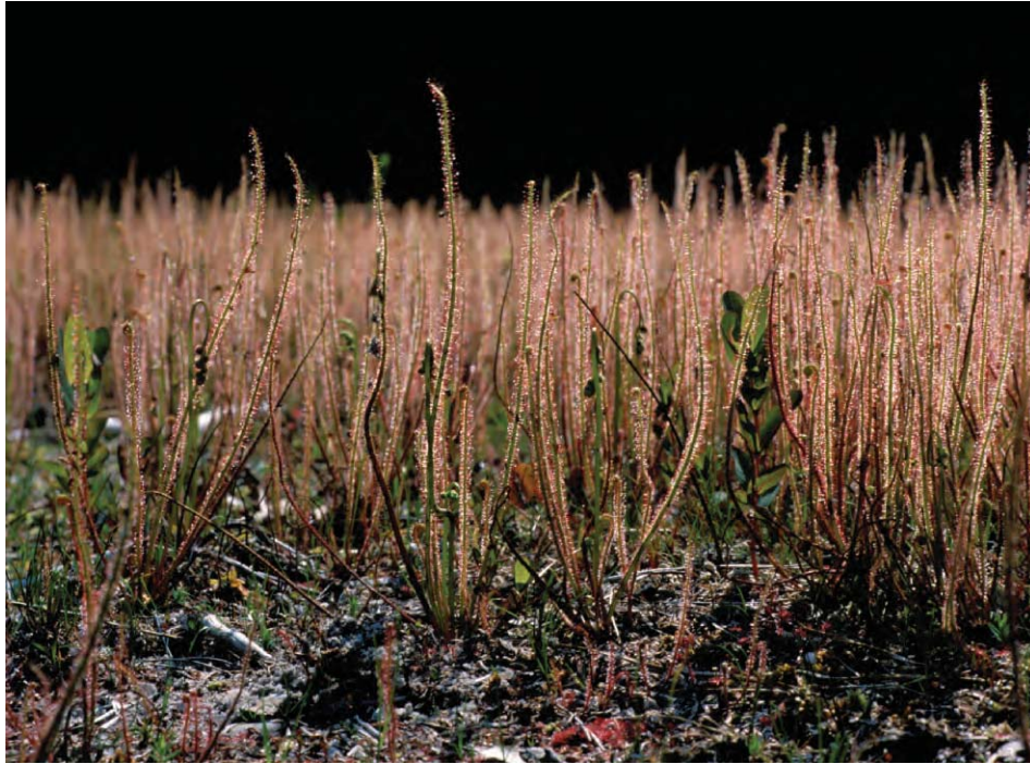
Figure 3: Drosera filiformis growing on sandy flats in New Jersey (Ocean County).