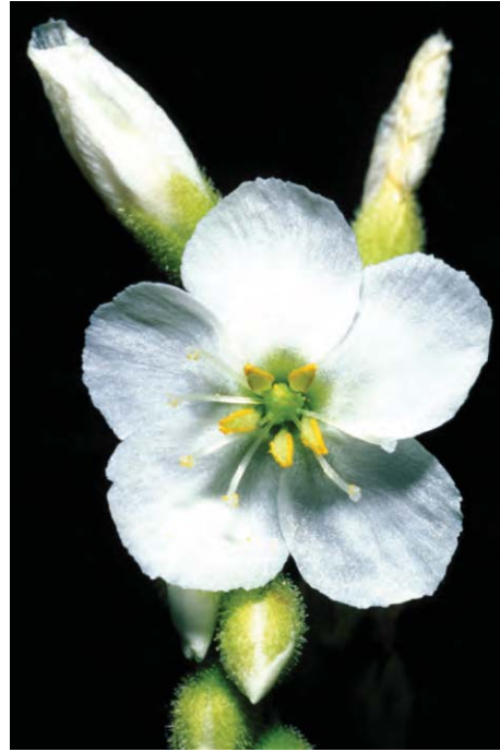
Figure 5: The white-flowering, mutant form of Drosera tracyi .

species when you consider the total ranges shown in Table 2—for example the number of flowers per inflorescence can range from 4 to 21 for D. filiformis and 12 to 20 for D. tracyi . The overlap here is significant, but the one-sigma ranges in Table 3 do differ much more clearly, i.e. , 7-15 for D. filiformis and 13-19 for D. tracyi .