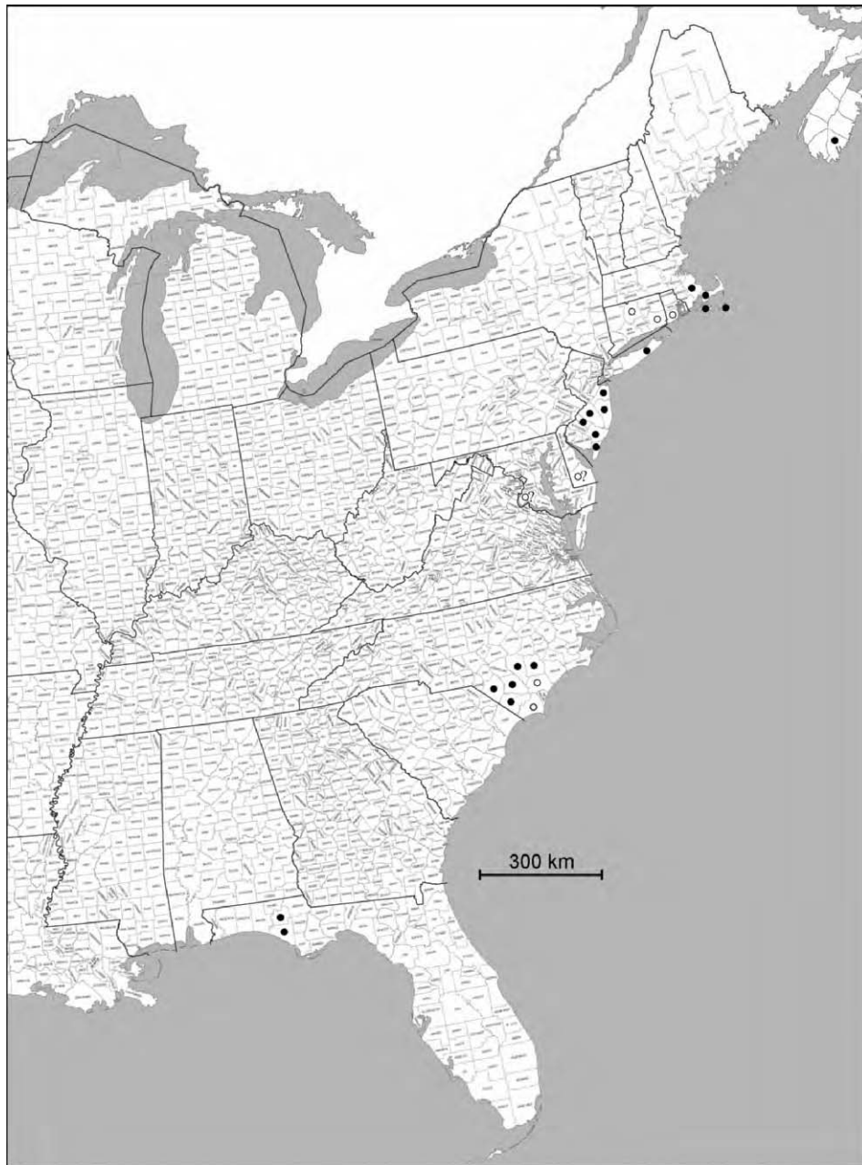
Figure 2: A 2010 snapshot of the range of Drosera filiformis . Counties believed to currently maintain native populations are indicated by a black dot. Counties where it is believed D. filiformis has been extirpated are indicated by an empty circle. Only native sites have been plotted. The question marks for the Delaware and Maryland sites note that it has not been confirmed that Drosera filiformis has ever occurred as a native at these locations.