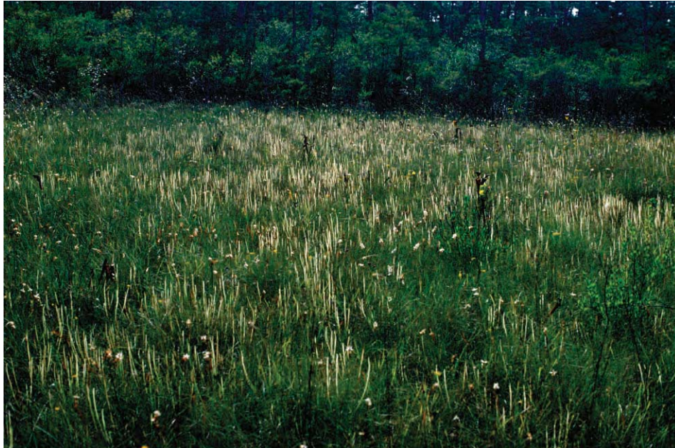
Figure 6: A familiar view of Drosera tracyi , backlit in the evening sunset (Liberty County, Florida).

different species concepts may come to different conclusions, and I do not fool myself into thinking I have had the last word on the subject of the two thread-leaf sundews. As Peter Taylor (1989) wrote, “Nothing is perfect, except perhaps the plants that we study and attempt to understand....”