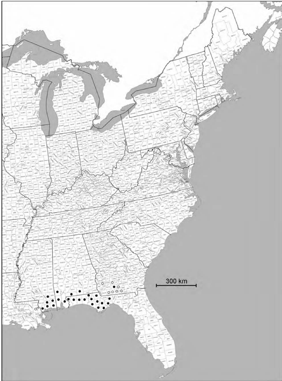
Figure 1: A 2010 snapshot of the range of Drosera tracyi . Counties or parishes believed to currently maintain native populations are indicated by a black dot. Counties where it is believed D. tracyi has been extirpated are indicated by an empty circle. The question mark for the Louisiana site notes that it has not been confirmed that Drosera tracyi has ever occurred there.