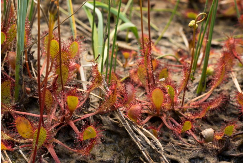
Figure 7: Drosera x woodii . The short-leaved form of this plant (Lewis and Clark County, Montana). The overall plant morphology is strongly suggestive of a Drosera rotundifolia parentage.