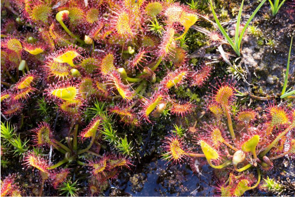
Figure 1: Drosera rotundifolia . Plants as typically seen (Tehama County, California). Note the ground-hugging habit, and leaves with glandular blades wider than long. Additional images can be seen at https://calphotos.berkeley.edu/ by selecting “Scientific Name EQUALS” Drosera rotundifolia , and “Photographer EQUALS” Barry Rice.