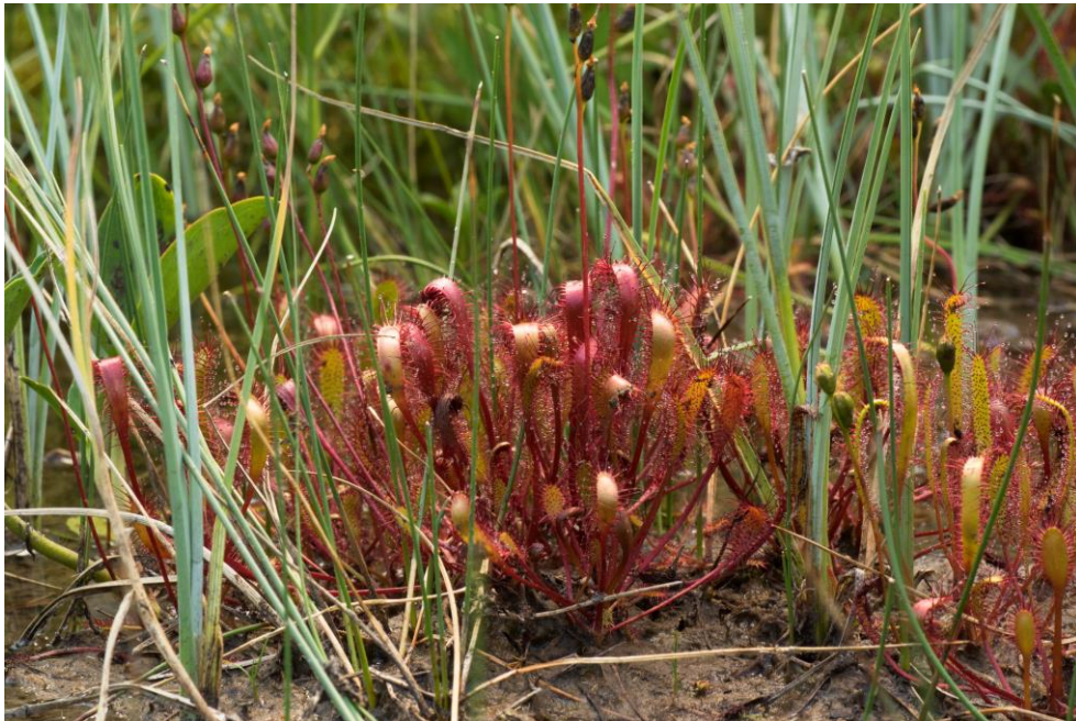
Figure 6: Drosera x woodii . The long-leaved form of this plant is at center and left, while Drosera linearis is at right (Lewis and Clark County, Montana). Notice the slender seedpods on the tall inflorescences of the sterile hybrid, in contrast with the plump seedpods on the short inflorescences of Drosera linearis visible here and in Figure 4.