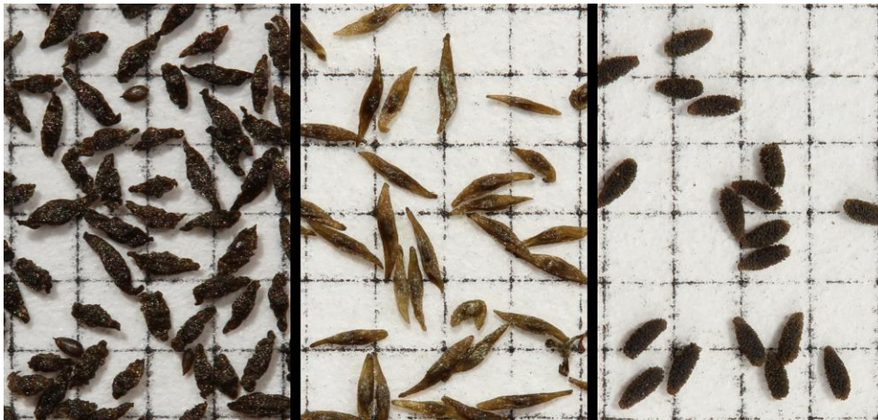
Figure 10: Seed coats of D. anglica , D. rotundifolia , and D. intermedia , photographed on a 1 mm grid. Note the papillose seed coats of D. intermedia . The seeds of D. linearis are not shown, but do not bear papillae.