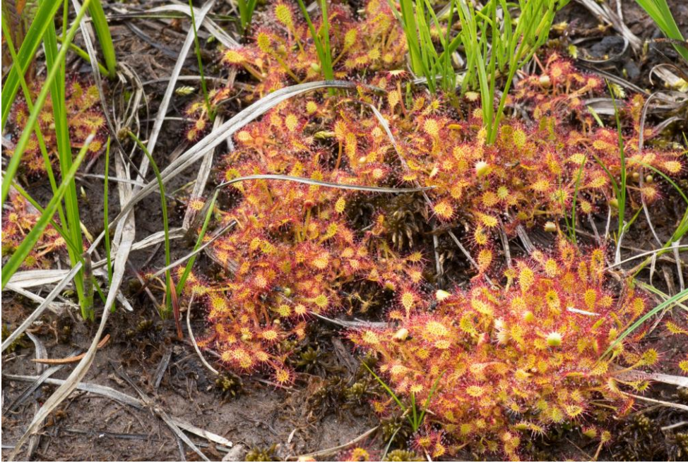
Figure 3: Drosera anglica . Short-leaved, clumping plants that have been incorrectly identified as D. intermedia (Boundary County, Idaho).