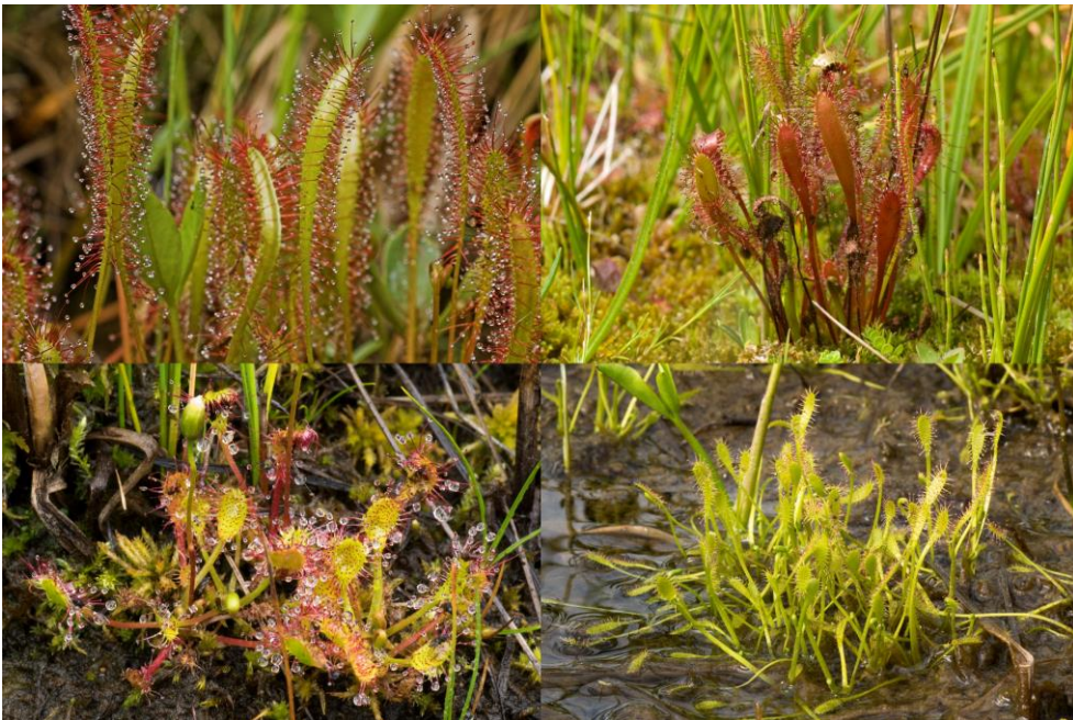
Figure 2: Drosera anglica . Various forms of this plant—Top-left: long-leaved plants (Plumas County, California); Top-right: typical, medium-leaved plants (Butte County, California); Bottom-left: short-leaved plants (Valley County, Idaho); Bottom-right: very green plants (Custer County, Idaho). Additional images can be seen at https://calphotos.berkeley.edu/ by selecting “Scientific Name EQUALS” Drosera anglica , and “Photographer EQUALS” Barry Rice.