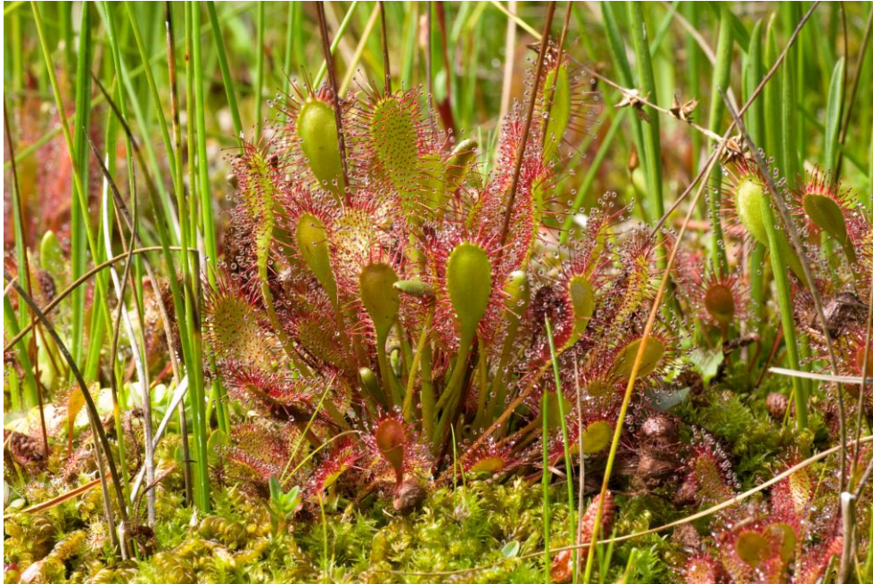
Figure 5: Drosera x obovata . Plants with very typical leaf shape (Butte County, California). Additional images can be seen at https://calphotos.berkeley.edu/ by selecting “Scientific Name EQUALS” Drosera x obovata , and “Photographer EQUALS” Barry Rice.