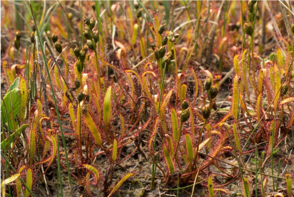
Figure 4: Drosera linearis . Typical plants (Lewis and Clark County, Montana). Note how the margins of the leaf blades are parallel over much of their lengths. Additional images can be seen at https://calphotos.berkeley.edu/ by selecting “Scientific Name EQUALS” Drosera linearis , and “Photographer EQUALS” Barry Rice.