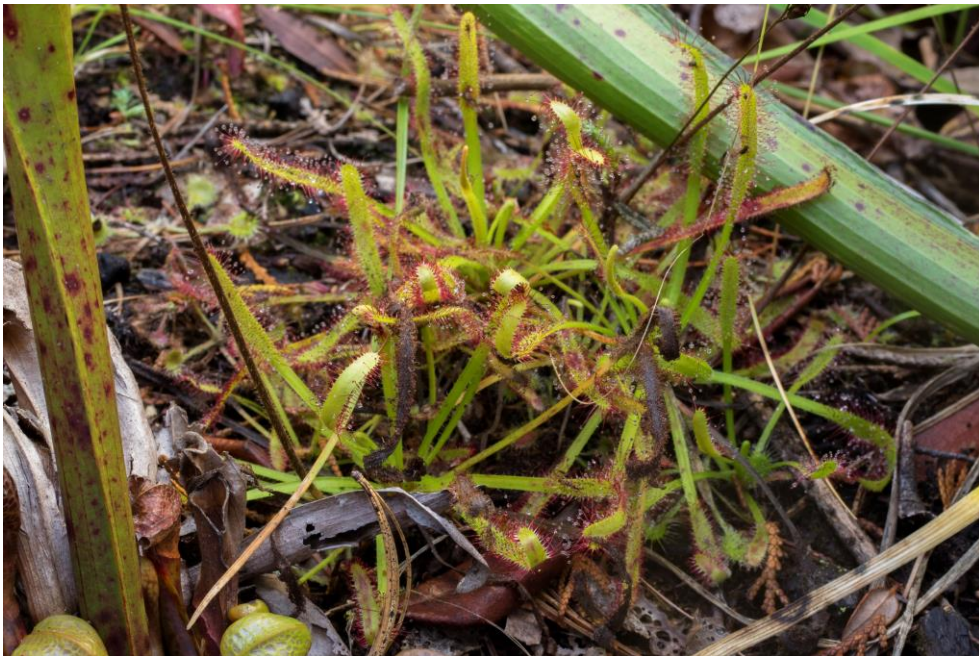
Figure 8: Drosera capensis . The morphology of the leaf-blade is similar to Drosera linearis (Del Norte County, California). Drosera rotundifolia is also visible in the rear left. Additional images can be seen at https://calphotos.berkeley.edu/ by selecting “Scientific Name EQUALS” Drosera capensis , and “Photographer EQUALS” Barry Rice.