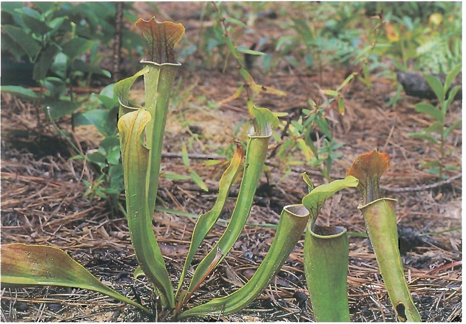
Figure 3: Small Sarracenia oreophila plants persisting despite frequent poaching at a flatwood bog.