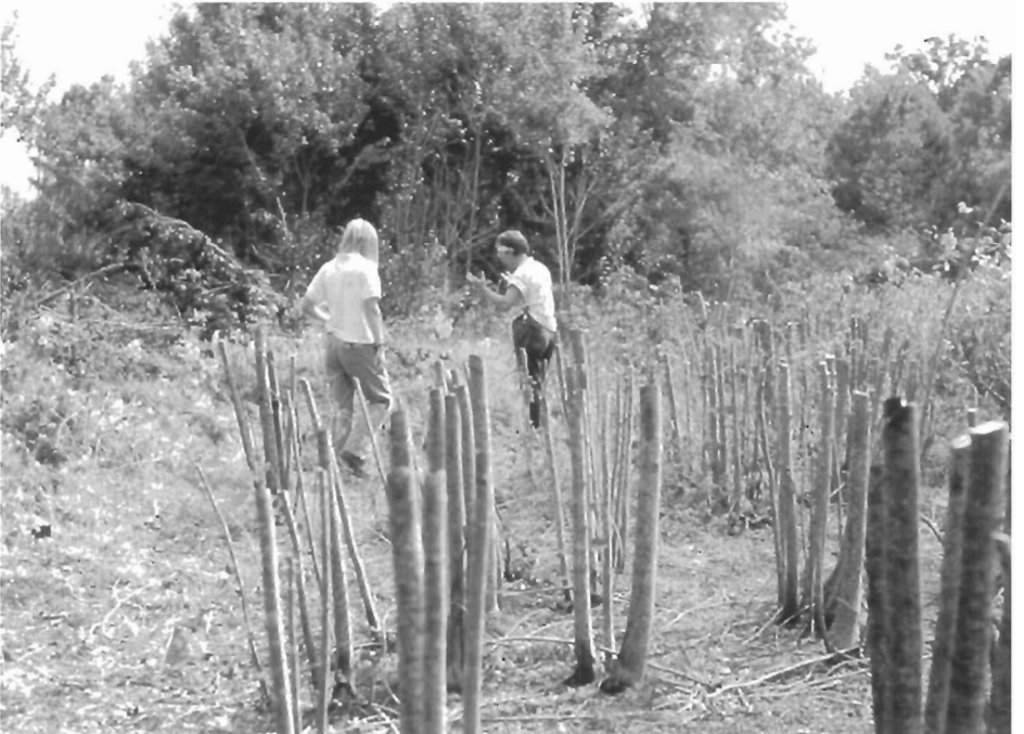
Figure 2: Discussing the effects of woody plant removal at a Sarracenia oreophila site.