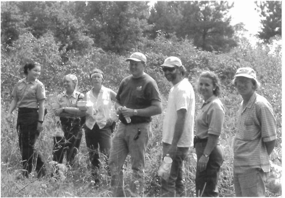
Figure 1: Several meeting attendees review the management actions at a Sarracenia oreophila seepage bog.