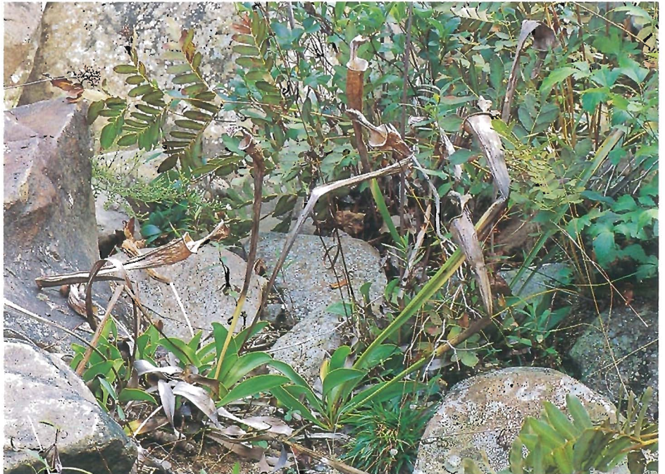
Figure 4: Sarracenia oreophila plants, mostly dormant, in streamside habitat.